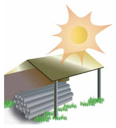
▲ Fig. 6: Protect pipes against U.V. radiation