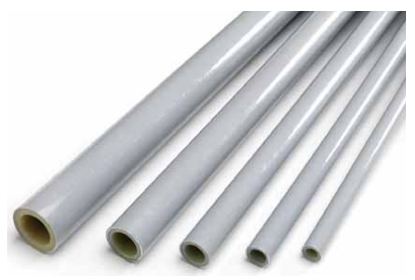
▲ Fig. 4: Universal Jentro STABIL pipes 16 - 40 mm.

M 25 / Golan-Jentro / PE-Xa-Al-PE-Xb / 20 x 2.9 / UNIVERSALROHR Sauerstoffdicht STABIL / 70 ° C / 10 bar / (95max) / DW-8501BQ0347 / PCT / Nr 1234 / 469 / 01.09.07